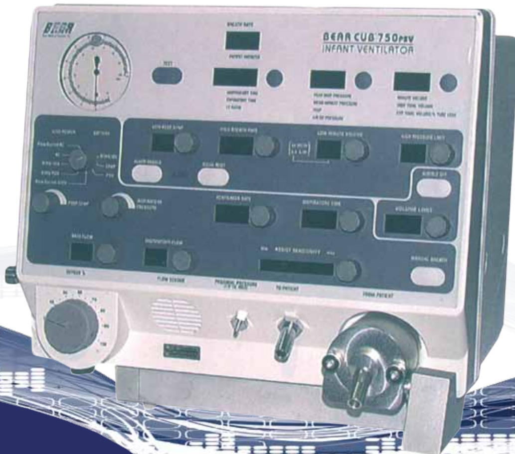
Typical Manufacturer's Photo

Seattle Technology: Surgical Division • 3915 152nd St. NE • Marysville, WA 98271 Phone: 1-800-827-3747 • www.stsurg.com • Email: info@stsurg.com